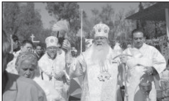
Metropolitan Tikhon and Archbishop Alejo delight faithful and neighbors as they bless the park next to Mexico City's Ascension Cathedral.

the delight of the many people who had gathered there. Before the procession, a large cross, which was elevated in