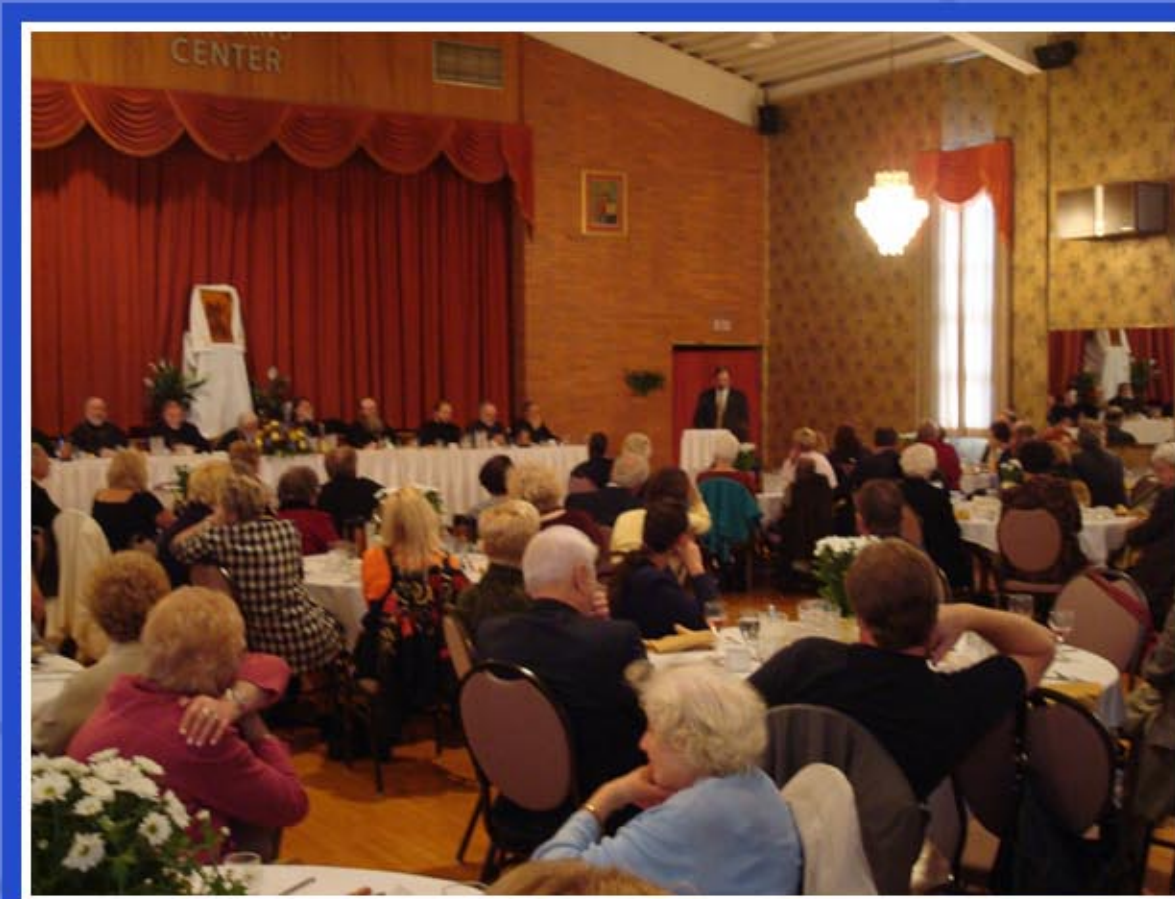
Left: The OCA Archivist was the banquet speaker at Saint John the Baptist Russian Orthodox Cathedral (ROCOR) in Mayfield, PA for the celebration of the centennial of the First All-American Sobor in October 2007.

The department provides various consultant services to parishes and institutions in conjunction with the preservation of their own historical records. The department produces occasional books and publishes regular articles on historical topics in OCA periodicals and a variety of other publications. Department members are available to deliver lectures and other presentations.