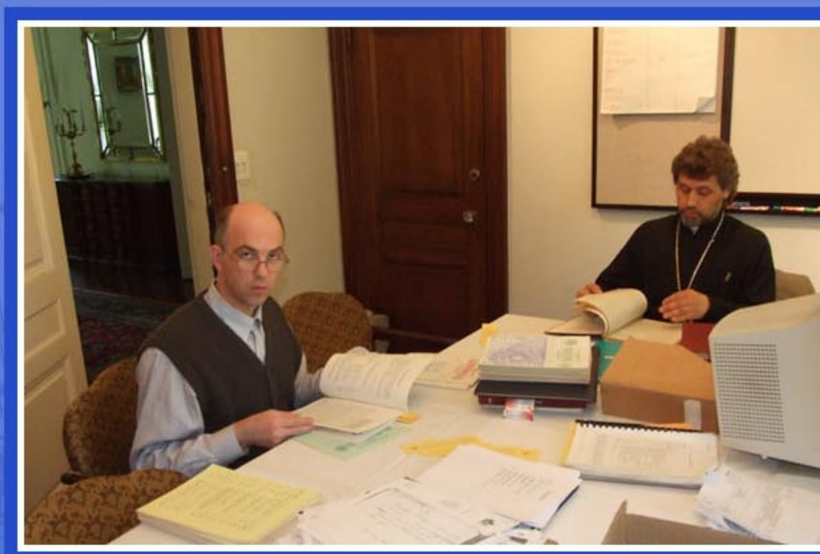
The OCA Archives contains a wealth of archival documentation on parish history. Among parish history researchers in 2006 and 2007 were clergy and faithful from Montreal, QC, Canada (left) and South River, NJ (right).