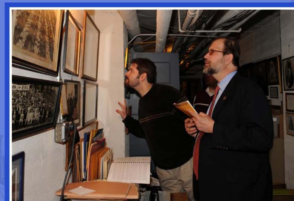
Left: Many people visit the OCA Chancery every year. All are afforded the opportunity to see the unique treasures of the OCA Archives. Here, a member of the delegation of the OCA Romanian Episcopate, invited to a session of the Holy Synod in May 2008, tours the OCA Archives.