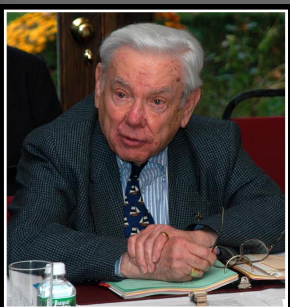
DR. JAROSLAV PELIKAN 1923-2006