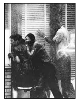
We confess that we often prefer stability to upheaval, even when upheaval is the necessary precondition for the establishment of justice.

We confess that we often prefer stability to upheaval, even when upheaval is the necessary precondition for the establishment of justice. We confess that we often avoid the fiscal, emotional, and spiritual costs of changing our beloved institutions—even when called to do so by our Lord and Savior. Our churches and denominational structures thus fail in critical ways to model the "creative psalm of brotherhood" invoked by Dr. King. <sup>29</sup> Recent efforts in the Christian community toward "racial reconciliation," though laudable in intent, tend to stop short of Dr. King's vision of true justice and fellowship. Sunday morning remains the most segregated time in our nation.