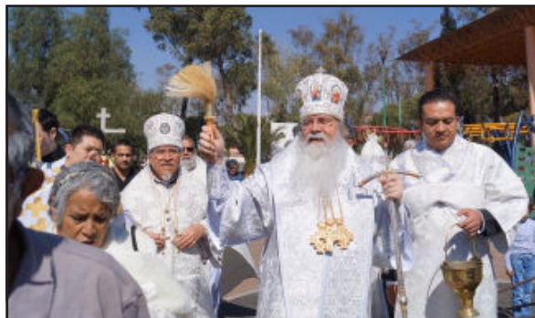
Metropolitan Tikhon and Archbishop Alejo delight faithful and neighbors as they bless the park next to Mexico City's Ascension Cathedral.

the delight of the many people who had gathered there. Before the procession, a large cross, which was elevated in